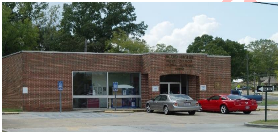
Helena Post Office

six parking spaces and the driveway was made one way. Still, its location, though centrally located, is too small to handle the increase in traffic from customers who use the post office, and the location will become more congested as Helena's population continues to grow. However, the United States Postal Service (USPS), due to unprecedented losses and significant decline in number of pieces mailed which are forecasted to continue for the next decade, is currently exploring ways to get leaner and move away from standard post offices. Ideally, the USPS desires to bring, via the internet or in person, many of the services and products found in a post office to the customer at his home or office and also to provide services such as mailboxes offsite at retail establishments. Although the USPS is not in favor of shutting down or merging post offices in order to trim costs, it is not keen on the idea of building post offices either. Even though the USPS may not support building a new post office, a precedent has already been set recently for a Helena neighbor. A new post office was constructed off State Route 119 in Alabaster within the past decade.