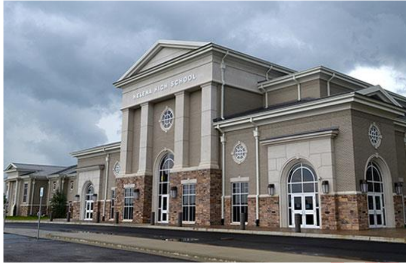
Helena High School

Helena High School (HHS) opened for the 2014 school year, graduating its first senior class in the spring of 2015. The School building offers a wireless environment for students and faculty and its classroom are constructed to double as storm shelters. HHS serves children grades nine through twelve. Based on information provided by the Helena Fire Marshall, HHS has 55 classrooms with an overall estimated student capacity 1 of 1,650 students.