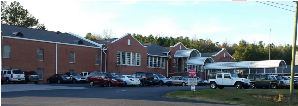
Helena Elementary School

The City of Helena is served by two separate school systems. For those residents who live within Shelby County, students attend schools within the Shelby County School system, and for those residents who live within Jefferson County, students attend schools within the Jefferson County School system. There are four Shelby County schools within Helena's city limits.