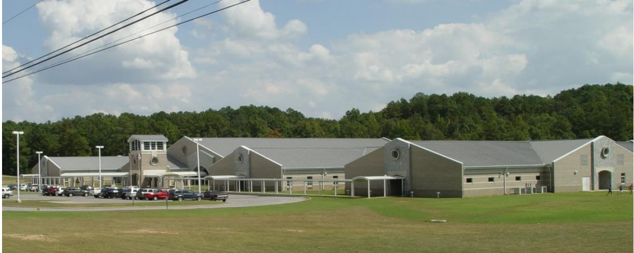
Helena Intermediate School

Helena Intermediate School (HIS), which opened in 2001, serves children in third through fifth grades and has a capacity of 650 students. Additions made to HIS over the past ten years has provided additional classroom space and eliminated the need for portable classrooms. Based on information provided by the Helena Fire Marshall, HIS has 47 classrooms with an overall estimated student capacity 1 of 1,410 students.