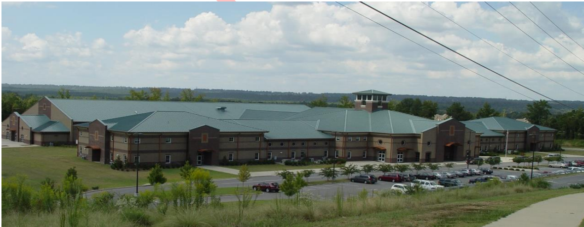
Helena Middle School

Helena Intermediate School (HIS), which opened in 2001, serves children in third through fifth grades and has a capacity of 650 students. Additions made to HIS over the past ten years has provided additional classroom space and eliminated the need for portable classrooms. Based on information provided by the Helena Fire Marshall, HIS has 47 classrooms with an overall estimated student capacity 1 of 1,410 students.