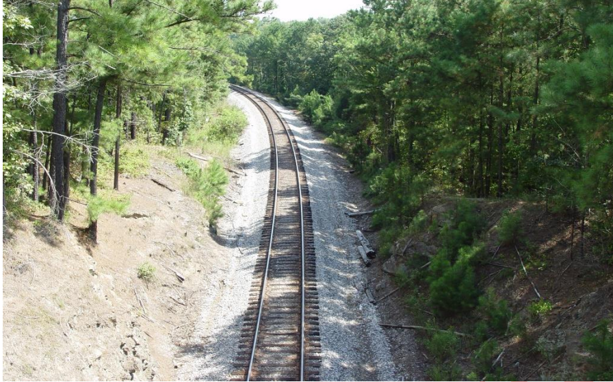
Railroad traversing Riverwoods Subdivision

Recreational land use classification is defined as land used for the operation and/or provision of services for a variety of leisure activities such as active parks which include baseball/softball fields, football fields, soccer fields, tennis courts, and basketball courts; passive parks which include open fields for general use with a scattering of picnic tables, pavilions, and/or stages; greenways and trails; golf courses; recreational centers; swimming pools; and historical/archaeological/ecological sites. This land use encompasses 446 acres.