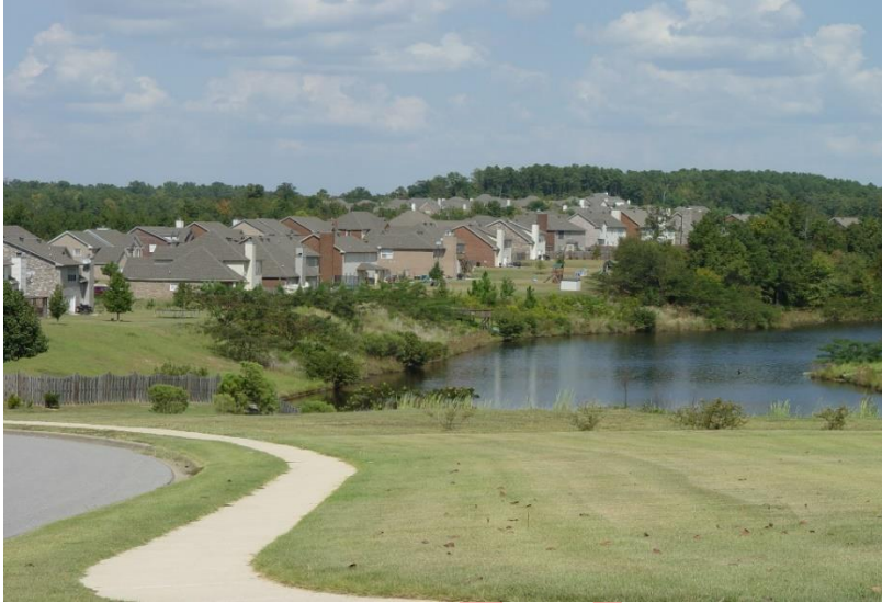
Old Cahaba Subdivision in Shelby County

Residential land use classification is defined as land which has been subdivided and/or developed with structures such as single family dwellings, manufactured and mobile homes, apartments, duplexes, trailer parks, and senior living facilities where dwelling units within each type of structure are either owned or rented by individuals who typically consider such units their permanent residences. Within Helena, this land use encompasses 2,024 acres.