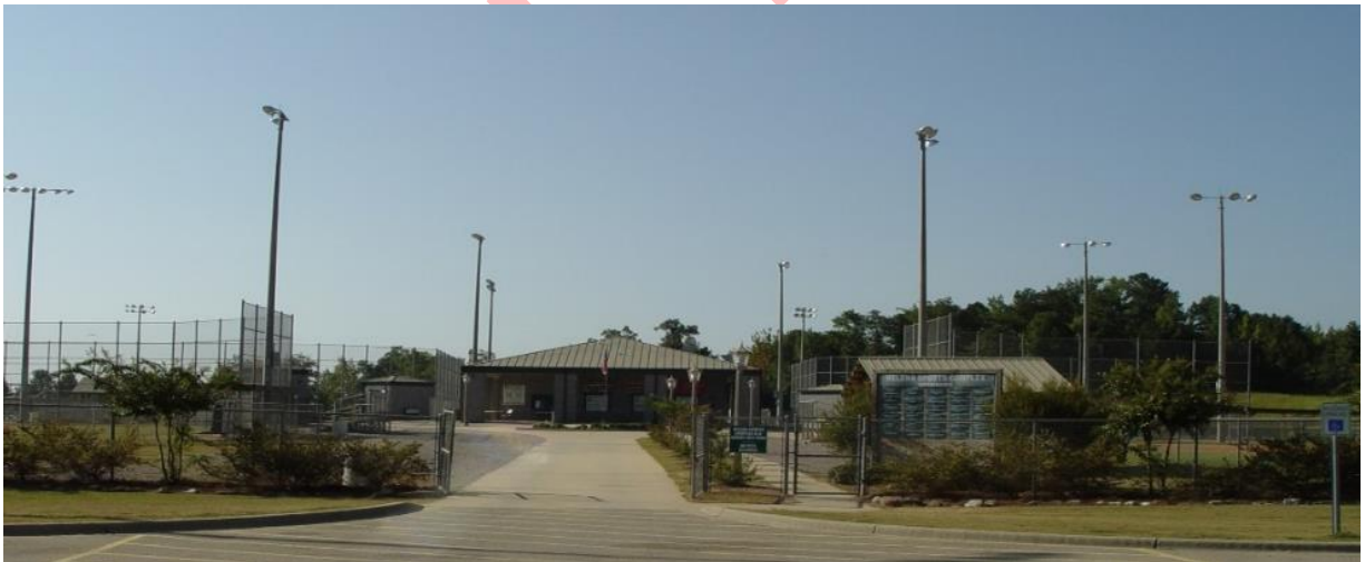
Helena Sports Complex

Recreational land use classification is defined as land used for the operation and/or provision of services for a variety of leisure activities such as active parks which include baseball/softball fields, football fields, soccer fields, tennis courts, and basketball courts; passive parks which include open fields for general use with a scattering of picnic tables, pavilions, and/or stages; greenways and trails; golf courses; recreational centers; swimming pools; and historical/archaeological/ecological sites. This land use encompasses 446 acres.