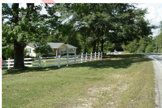
Rural Area off County Road 17

Rural land use classification is defined as land which has by and large been left undisturbed and undeveloped in relation to a built environment. This land use is typically found on the outer fringes of the city limits. The land within this classification comprises agricultural lands such as croplands, pasturelands, and forestlands. However, not all of the land here is used for agricultural purposes as large tracts of land do exist with no agricultural activities occurring. Developers may own large un-subdivided and undeveloped tracts within this classification. The only built environment found on these large tracts are barns, farmhouses, ranches, and scattered houses and manufactured homes not part of subdivisions. Within Helena, this land use encompasses 8,290 acres.