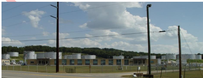
Plantation Pipeline Company Tank Farm