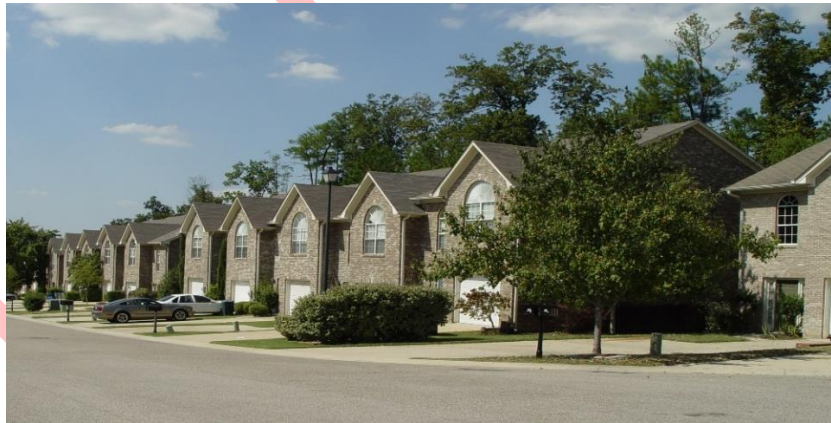
Townhomes off County Road 58 in Shelby County