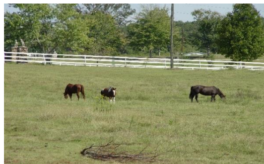
Rural Area off County Road 13