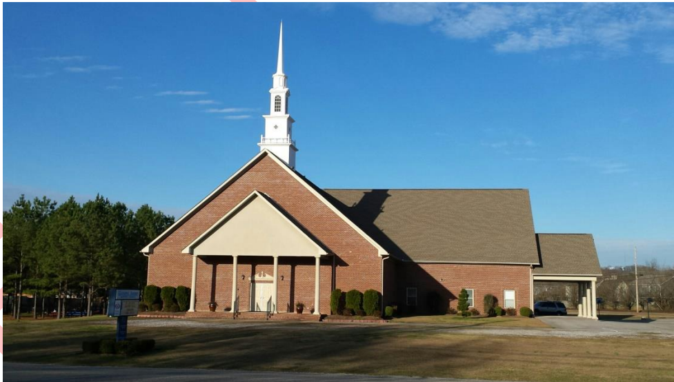
Helena Church – County Road 58

Institutional land use classification is defined as land used by public and quasi-public entities such as governments, religious organizations, and non-profit agencies for administrative buildings, fire stations, police stations, libraries, museums, post offices, schools, churches, and cemeteries. Within Helena, this land use encompasses 192 acres.