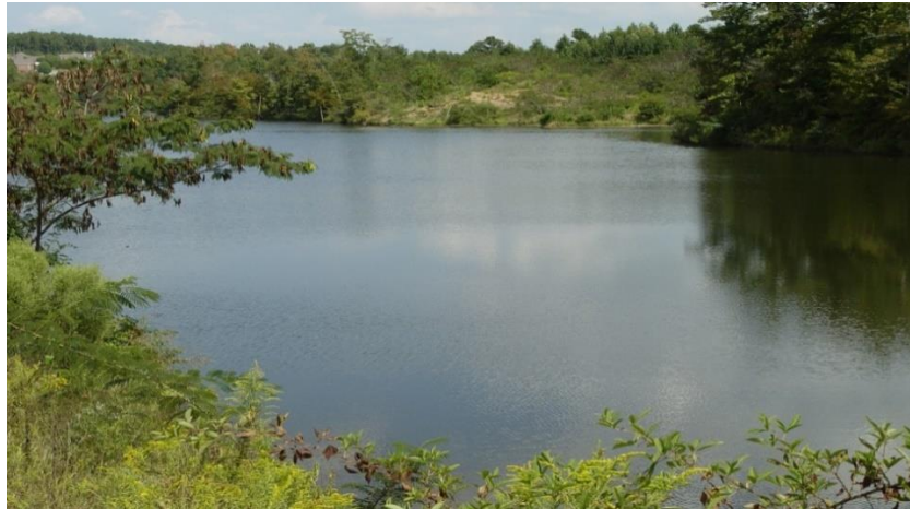
Lake in Old Cahaba Subdivision

Water/Wetlands land use classification is defined as land which is either permanently covered by water year round such as a river, lake, or pond; or has substrate that is non-soil and is inundated/saturated by water during the year, supports predominantly hydrophytes, and/or the substrate is predominantly un-drained hydric soil such as swamps. Within Helena, this land use encompasses 370 acres.