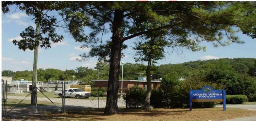
City of Helena Waste Water Facility

Transportation/Utilities land use classification is defined as land that is used primarily as part of a local or regional linear network to distribute manufactured goods, fuel, water, wastewater, communications, and/or people via pipelines, transmission lines, roadways, railroads, airways, and towers. Such networks include areas along the way needed to support this distribution such as tank farms, substations, water tanks, airports, pump stations, tower farms, and rail yards. Within Helena, this land use encompasses 1,266 acres.