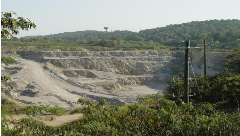
Vulcan Helena Quarry

Extraction land use classification is defined as land containing facilities used for the removal of natural resources such as coal, limestone, oil, natural gas, and water from beneath the earth's surface. Removal methods include surface mining such as strip and open-pit mining, underground mining using shafts and tunnels, and drilling. Within Helena, this land use encompasses 272 acres.