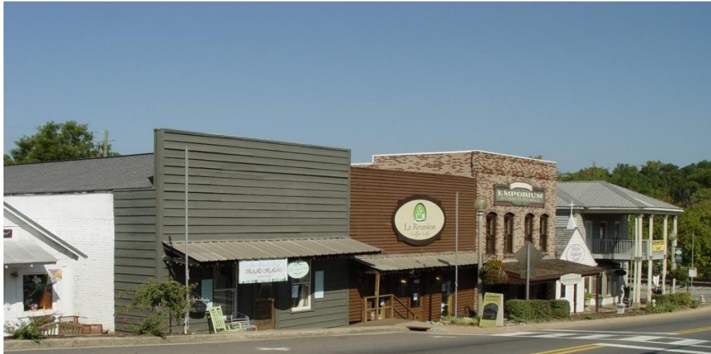
Old Town Helena

Commercial land use classification is defined as land which has been subdivided and/or developed to primarily carry on a wide range of business and office activities such as retail & wholesale trade; professional, scientific, & technical services; financial, insurance, & real estate agencies; information services; medical, health, & animal care; and accommodation services. Within Helena, this land use encompasses 109 acres.